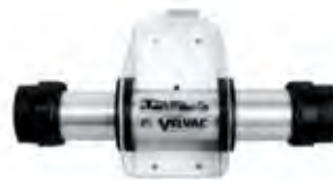
Standard Case with Bracket

Mounting Bracket : 5-3/4" high x 2-13/16" wide x 4" deep Mounting Holes : (5) 3/16" diameter Tube Diameter : 1-5/8"