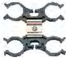
Part No. 580038