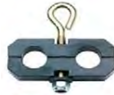
Part No. 580039