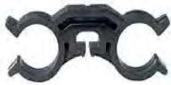
Part No. 580037