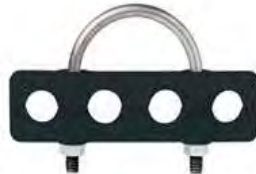
Part No. 580041