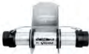
Case with Bracket and CapKeeper™ Cable