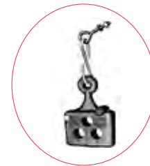
Part No. 581038