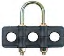
Part No. 580040