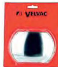
Stick-on Convex Mirror Package