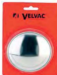
Stick-on Convex Mirror Package