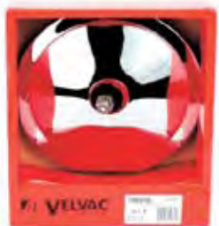
Convex Mirror Display Box