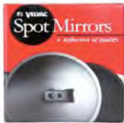
Spot Mirror Boxes

Velvac offers attractive packaging displays that mount easily on pegboard or wire display racks. Plain box packaging options are also available for some versions.