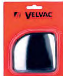
The "Wedge" Stick-on Convex Mirror Package