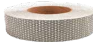
2" x 150' White 5 year (058398)