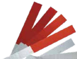
2" x 18" 11" Red / 7" White and 2" x 12" White Strips 5 year (058373 and 058374)