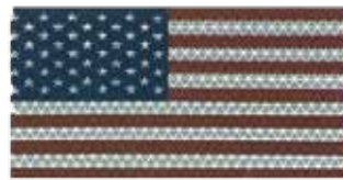
Reflective American Flag Decal 5 year (058399)