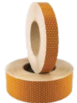
1" x 150' and 2" x 150' Yellow 10 year (058379 and 058400)