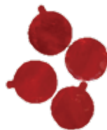
2.75" Red Circles (058377)