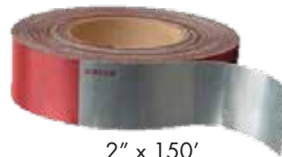
2" x 150' 11" Red / 7" White 3 year (058395)