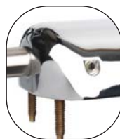
NEW 5/16" set screw helps hold mirror arm securely in place.